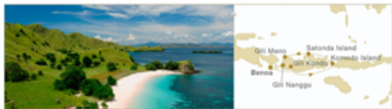
Above: one of the new routes for Star Clipper in 2017

Star Clipper is a modern cruise ship in every way, created for luxury-loving passengers who also love the traditions and romance of the legendary era of sailing ships. At 360ft long she carries just 170 guests in pampered comfort. Life aboard is blissfully relaxed, much like travelling on a private yacht. The ship offers spacious accommodation and expansive teak decks with ample space and not one, but two swimming pools.