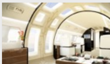
Above: Embraer Lineage 1000

Brazilian manufacturer Embraer has launched a design for its Lineage 1000 that really raises the bar: a sunroof that wraps around the sides and top of the aircraft, providing extensive views.